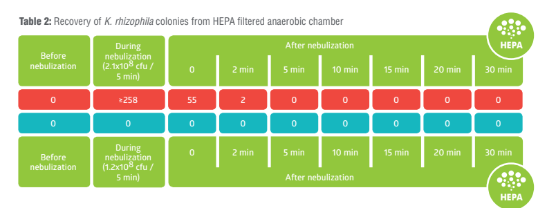
Table 3: Recovery of C. beijerinckii colonies from HEPA filtered anaerobic chamber